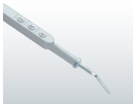
HAND CONTROL PENCIL