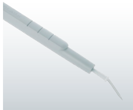
FOOT CONTROL PENCIL

Employed use of sheaths promotes pencil longevity, speeds changeover from patient to patient, and prevents pencil exposure to contaminants.